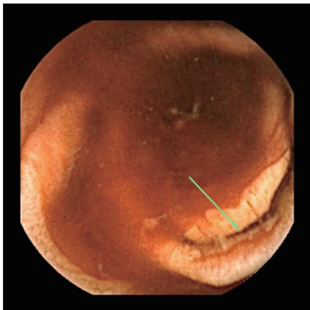
Fig. 3. Capsule endoscopy showing blood in the lumen and evidence of ulcer (arrow).