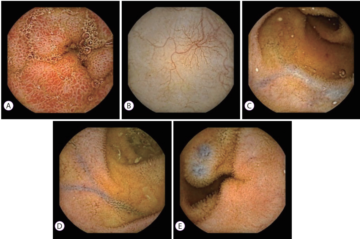
Fig. 1. Vascular changes seen on capsule endoscopy: (A) red spot, (B) telangiectasia, and (C) to (E) varices.